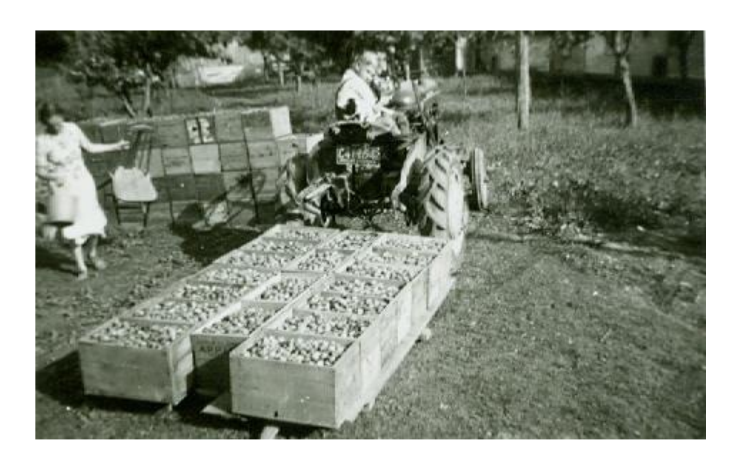
Italian Plum Harvest