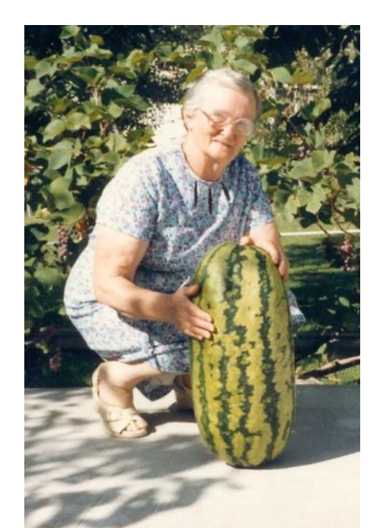
Moved to Oliver upon retirement in Enjoyed gardening