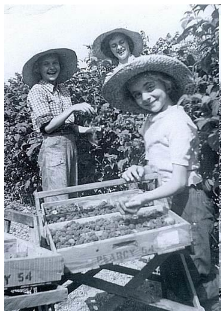
Raised strawberries and raspberries