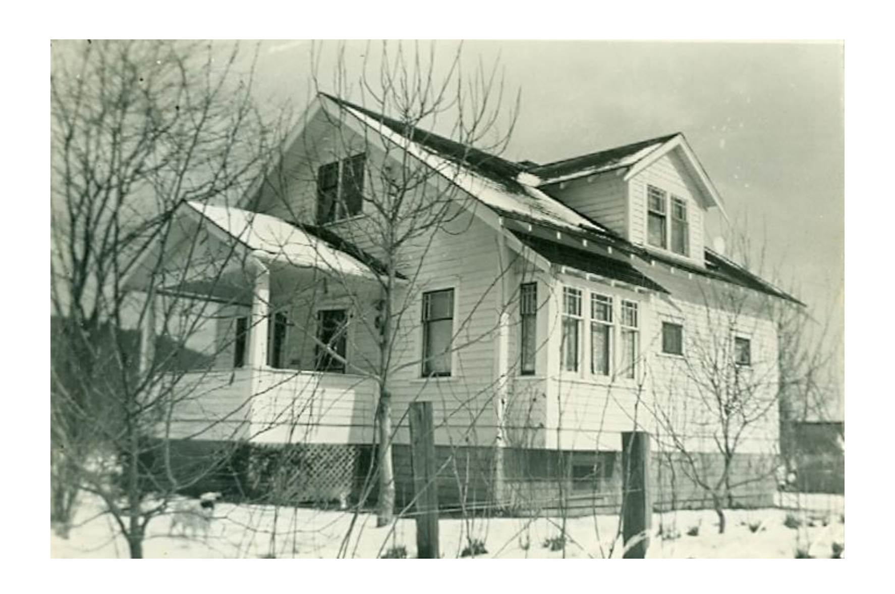
Family Home in the winter