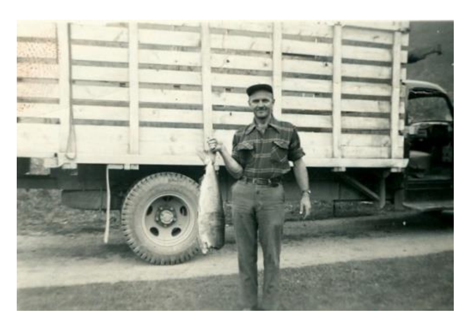
Trucking Business Time out to catch a salmon