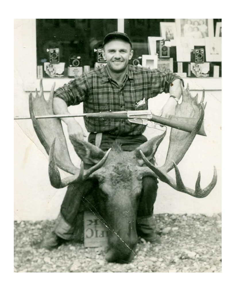
First moose he shot